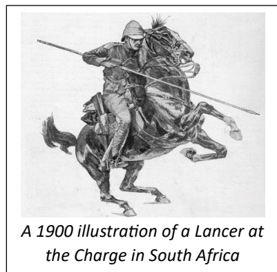
A 1900 illustration of a Lancer at the Charge in South Africa

In papers published in the Twenties, he described animal wastage in the Boer War as appalling; he meticulously counted every horse, noting that of 518,794 animals sent 347,007 were killed, and this led him to set about improving the Veterinary service. By World War One it had 18,000 soldiers. Specialist horse hospitals were established and he described the service’s objective as “to cure and not to kill”. He also said that “sick animals should receive modern scientific attention so as to ensure that as few as possible are lost.” The British Army Veterinary service was considered to be better equipped and trained than that of all the other armies in the war. One can only hope that the horses agreed.