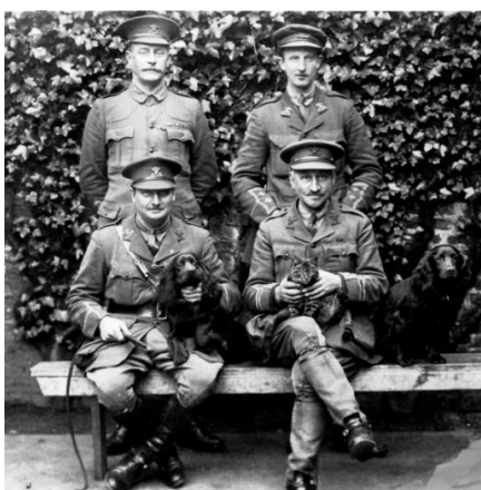
Four officers, two dogs and one wary cat at Longhirst

working animals. Some of these will have been for domestic purposes; Longhirst Hall's stables were quite modest when compared with other country houses such as Belsay and Chesters.